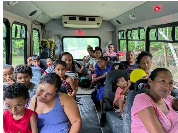
Some of our Families headed home after the overnight camp!

It is by your sacrificial giving of prayer, finances, serving alongside us, and sharing our ministry with others that allows us to serve in Belize.