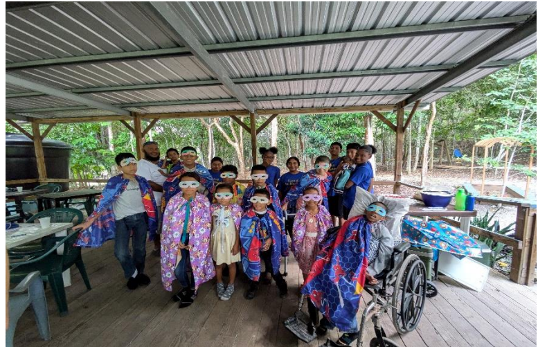
Camp Se Kansa! Heroes

2 Corinthians 9:11-12 You will be enriched in every way so that you can be generous on every occasion, and through us your generosity will result in thanksgiving to God. This service that you perform is not only supplying the needs of the Lord's people but is also overflowing in many expressions of thanks to God.