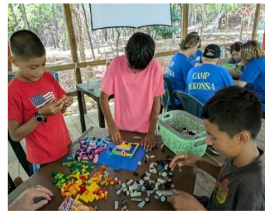
Monthly FUN events $250 USD https://secure.qgiv.com/for/skon