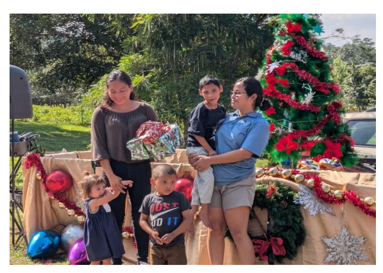
Camp Se Konsa! Christmas 2024

Our biggest Christmas ever happened Jan. 11, 2025 with over 200 people coming, and 109 children receiving gifts! Thanks to your Churches!